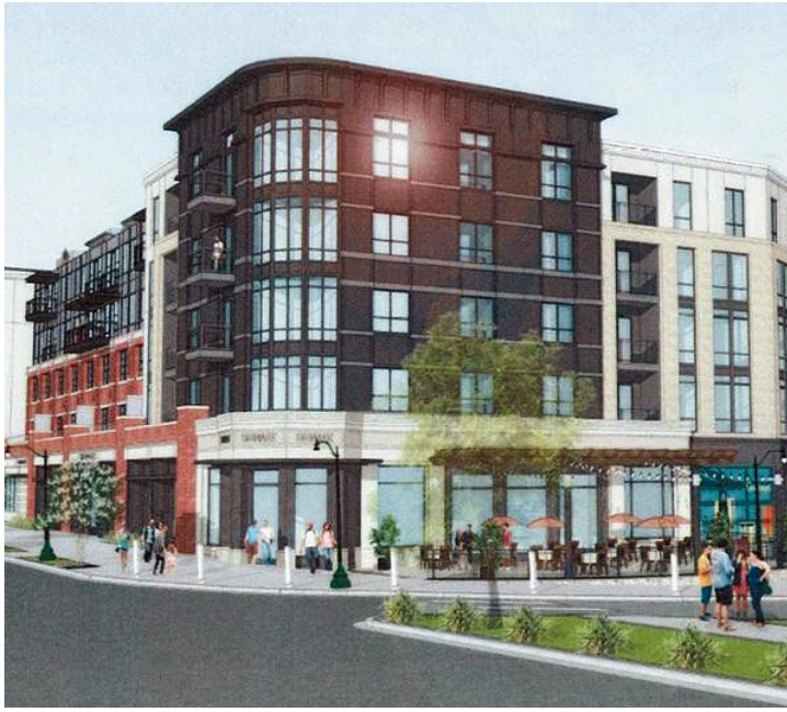
Concept Drawing by Fortus Group

Redevelopment of the former Anthem site at Taft Rd. and Woodburn Ave. continues toward construction start in spring 2020. When completed, the first phase will consist of 322 apartments and space for 4-5 new shops or restaurants along Woodburn Ave.