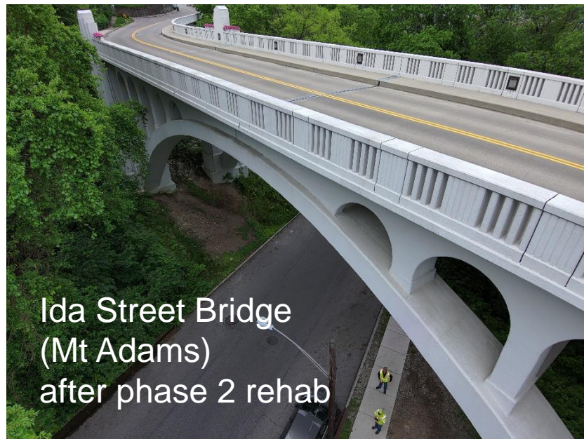
Ida Street Bridge (Mt Adams) after phase 2 rehab